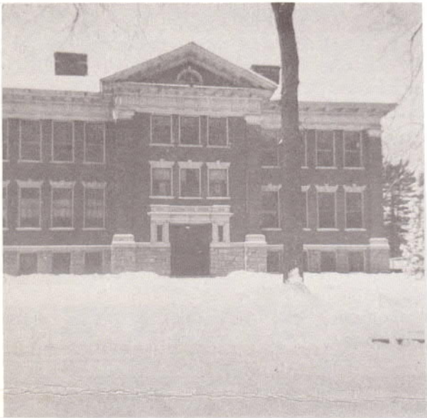
THE OLD SCHOOL

THE OLD SCHOOL HOUSE STOOD WHERE THE PRESENT BANDSTAND IS NOW