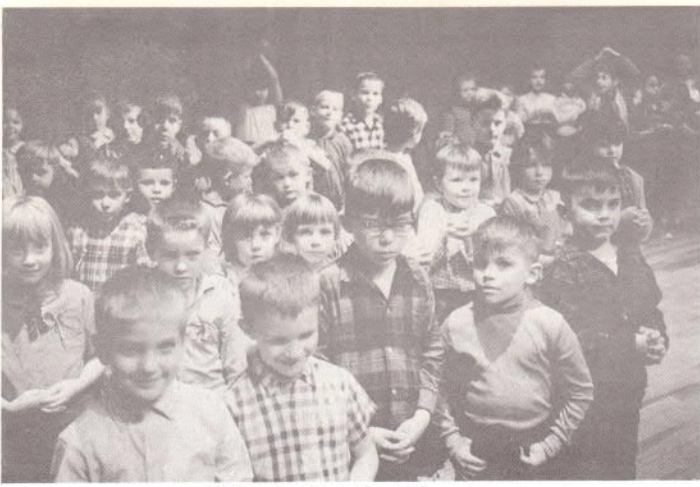
First Grade Chorus Practice for Christmas Assembly