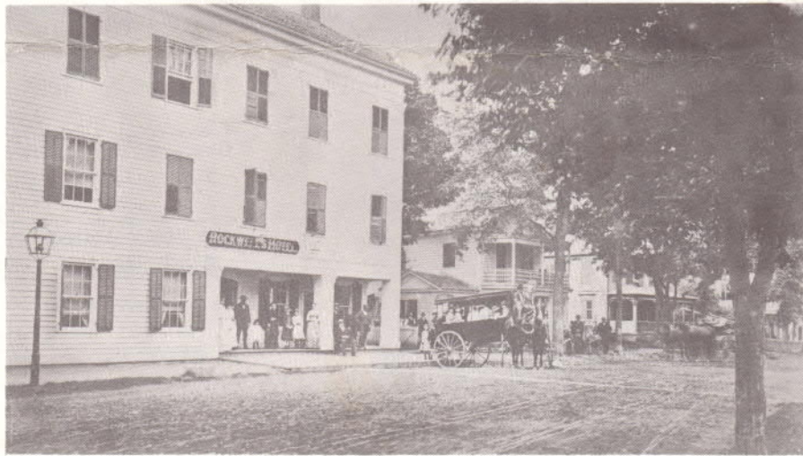
THE ORIGINAL ROCKWELL HOUSE