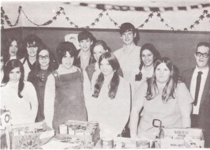
Honor Society Collects Food