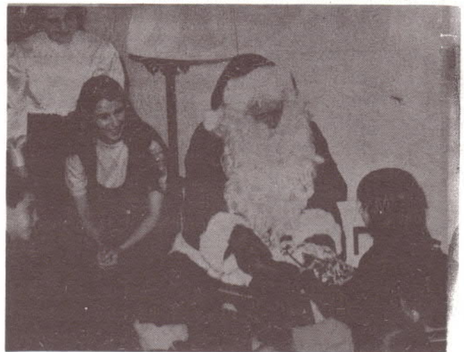
Seniors at Queen Anne