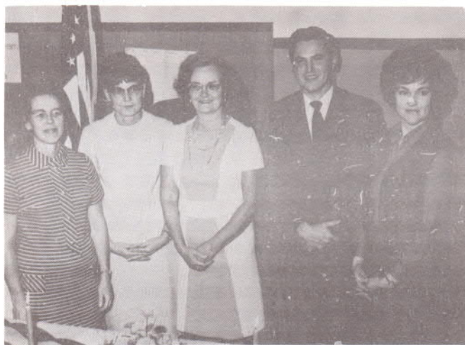
PTA Officers for 1971-1972