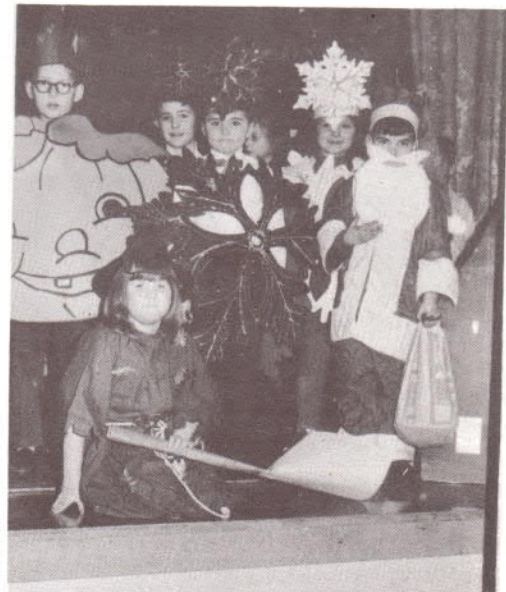
First Grade Christmas Play