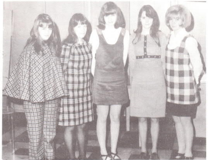
MEMBERS OF HOME ECONOMICS 3 CLASS MODEL AT FASHION SHOW

Wools, bonded jerseys, cottons and corduroys were featured in mini, midi and maxi lengths at the fashion show of the Home Economics 3 Class held during Nov.