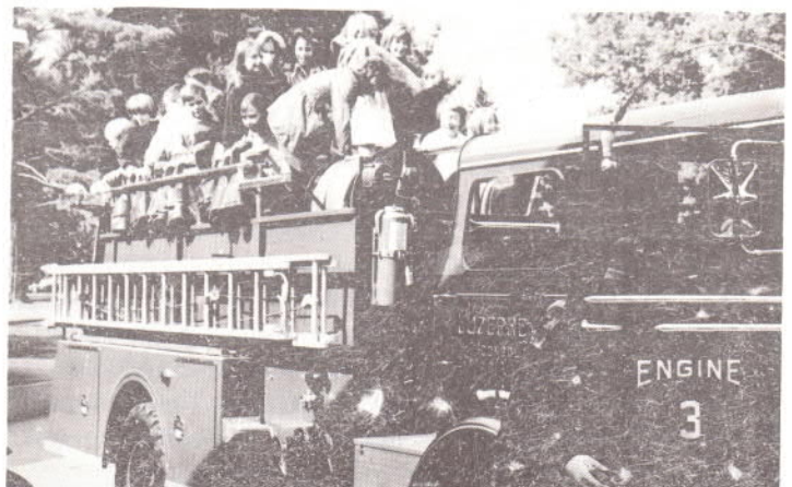
Youngsters Enjoying Ride