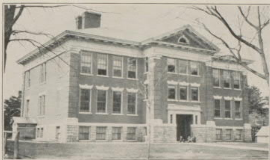
HADLEY-LUZERNE HIGH SCHOOL Hadley Luzerne - New York